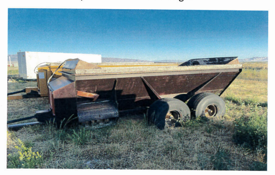
No information available $1000.00