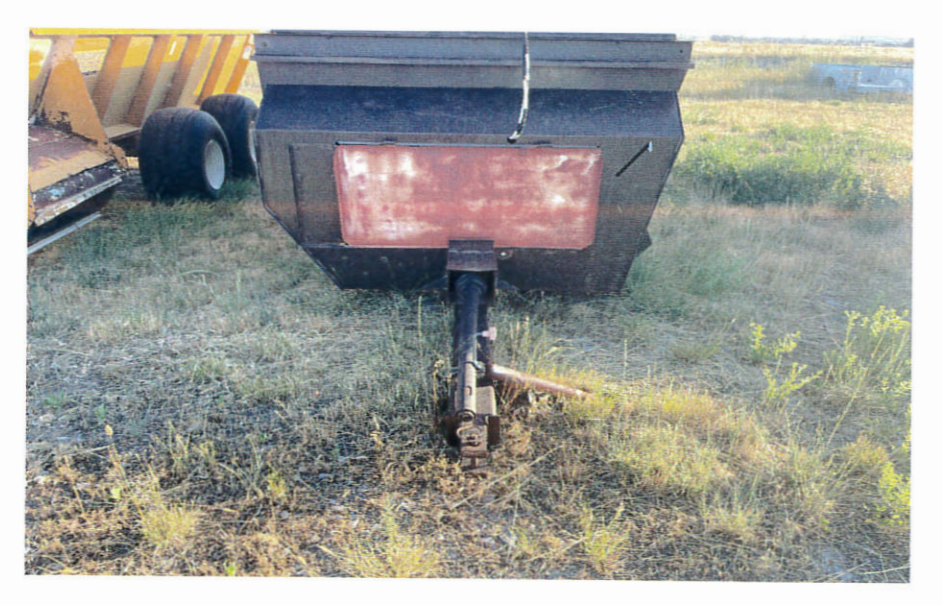
Does have multiple areas rusted through.